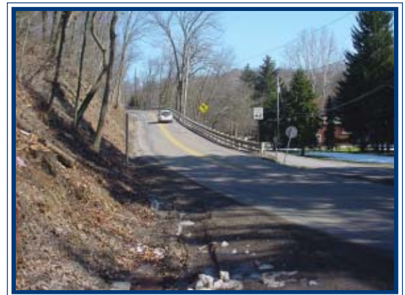
Steep grades along the existing roadway

Improvement alternatives are currently being developed which include widening existing roads, improving roadway geometry, and constructing portions of new roadway alignments. The development of alternatives consists of the following: preliminary engineering design, an analysis of environmental features, the minimization of impacts to existing homes and businesses, and consideration of community concerns. Throughout the preliminary design process, refinements will be made in order to determine the optimal transportation improvement for the area.