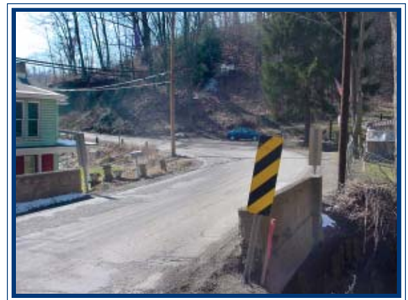
Narrow bridge and sharp turn near House of Mercy Church